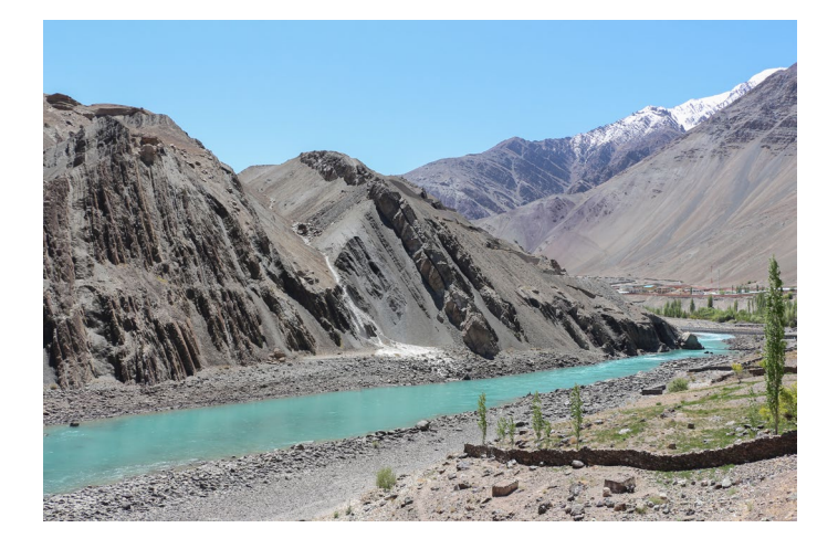
Day 3 Excursion to Khardung-la Pass

List of places visited – Alchi, Lamayuru, Pathar Sahib, Magnetic Hill, Hall of Fame.